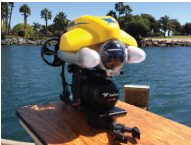
VideoRay Pro 4 ROV with V Series Imaging Sonar, Sonar Integration skid, Manipulator Arm